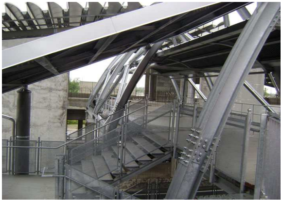
LINE 2 Pedestrian bridge over the highway Details