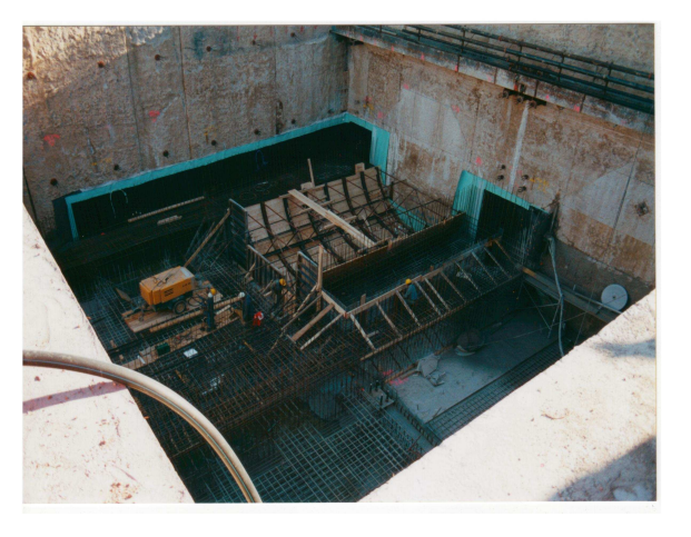
Line 1 FIORENZA well – TBM starts slab