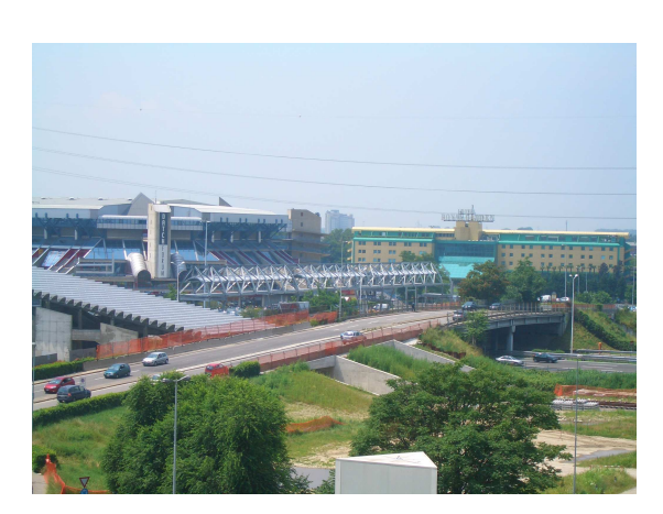
LINE 2 Pedestrian bridge over the highway Overall view