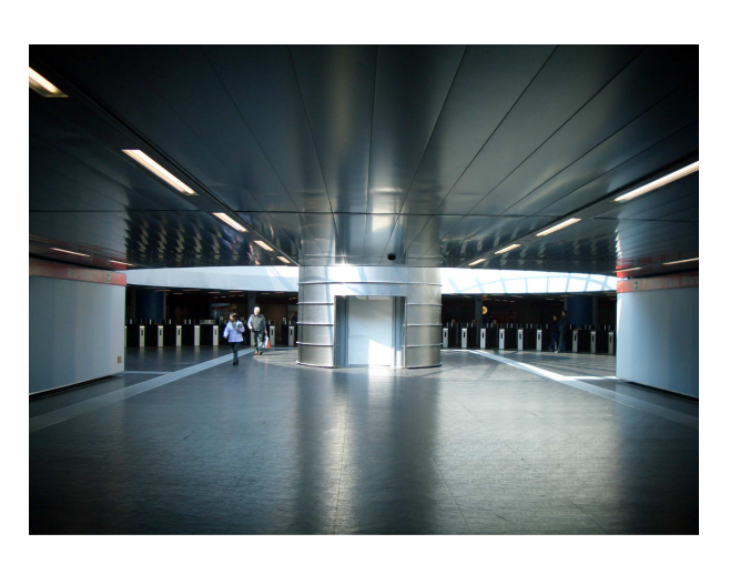
Line 1 – Station of RHO Large architectural roof opening completed