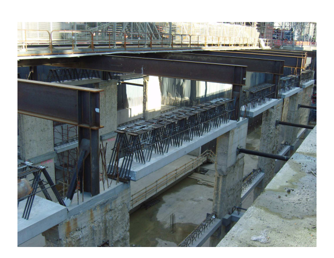
Line 5 Prefabricated steel/concrete beams "REP" system