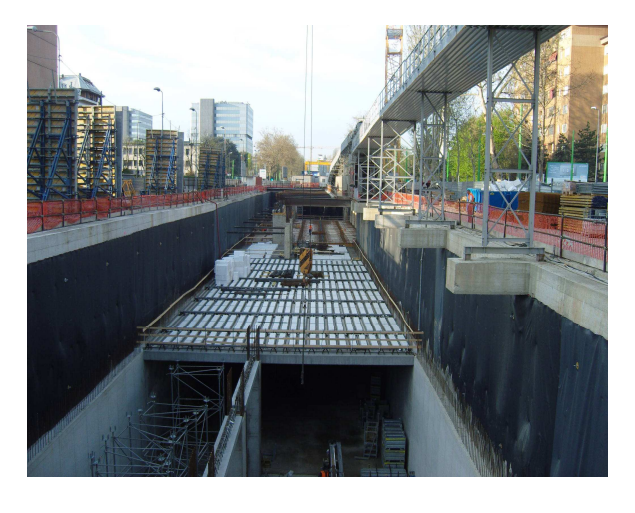
Line 5 BIGNAMI station – mezzanine deck