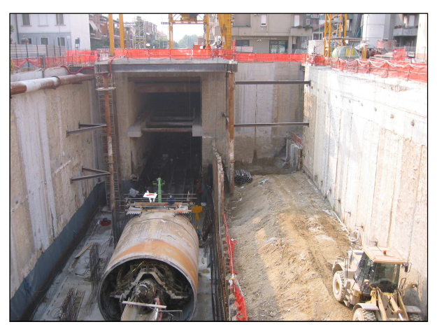
Line 1 TBM passing in PERO station