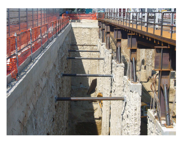
Line 5 BIGNAMI station - temporary steel deck