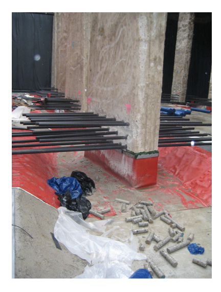
Line 5 Slurry concrete diafhragm connecting rebars to deck