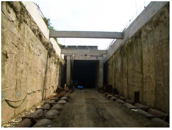
LINE 2 Concrete caisson gallery – pushing from back with jacks