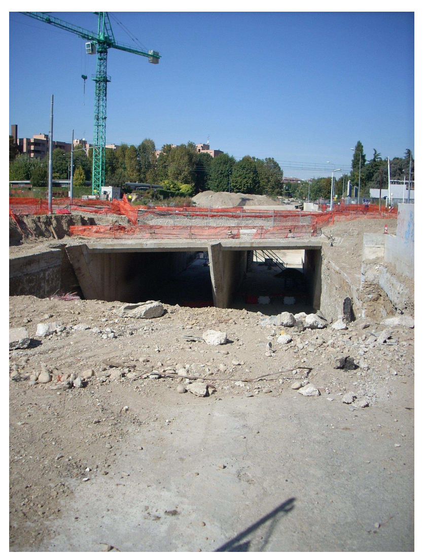
Line 3 Concrete caisson gallery pushed under railway